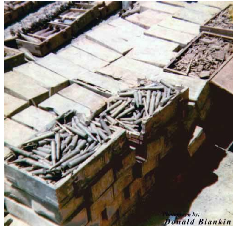
Weapons cache recovered near Ban-Me-Thuot, Nov. 68