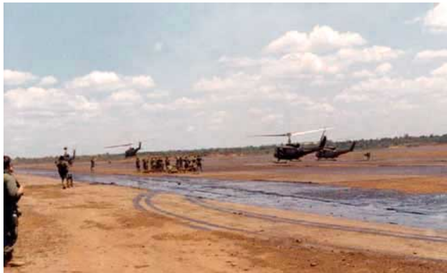
Beginning of CA out of Dak To "D" 1/35