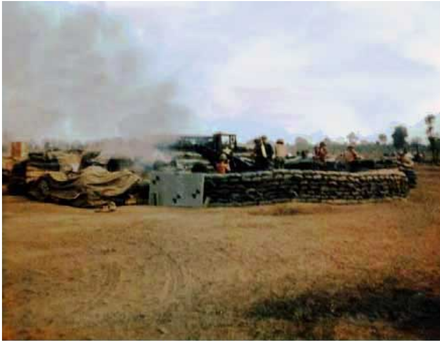
105mm support for "D" 1/35 Near Plei Mrong Early 1969