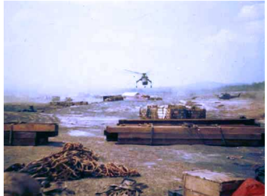
Flying Crane with slings of artillery ammo LZ-Mary Lou Kontum, Vietnam 3/20/69