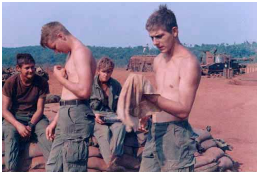
Members of "D" 1/35