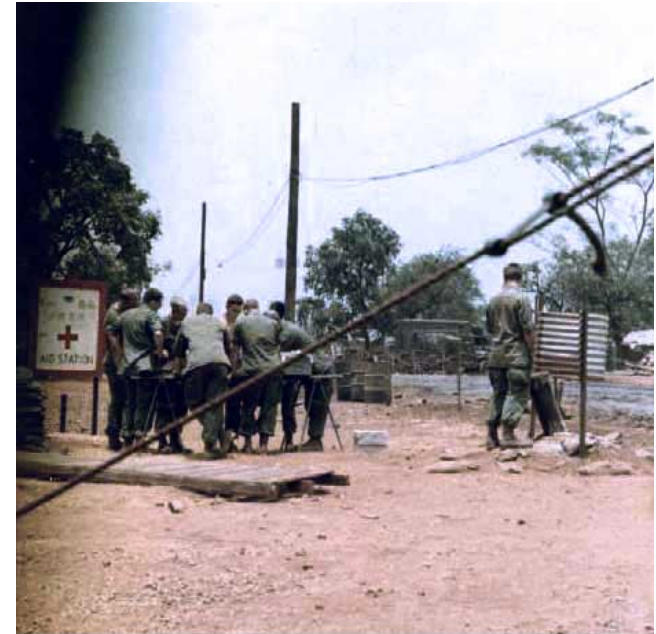
1/35 Aid Station-Oasis