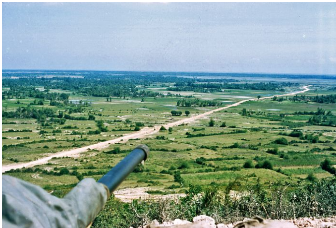
Duc Pho countryside.

9. Mission: 2/35 Inf TF under OPCON 2d Bde, 1 st Cav (Airmobile) was to conduct search and destroy operations in AO LeJeune and provide ready reserve force for the operation. A/2/35 assumed responsibility for initial RRF at 160730H April 1967. B/2/35 was to provide security on the western flank of Operation Golden Fleece, a rice harvest project designed to protect the local population from guerrilla activity in the harvest area. On order, conduct search and destroy operations to the north.