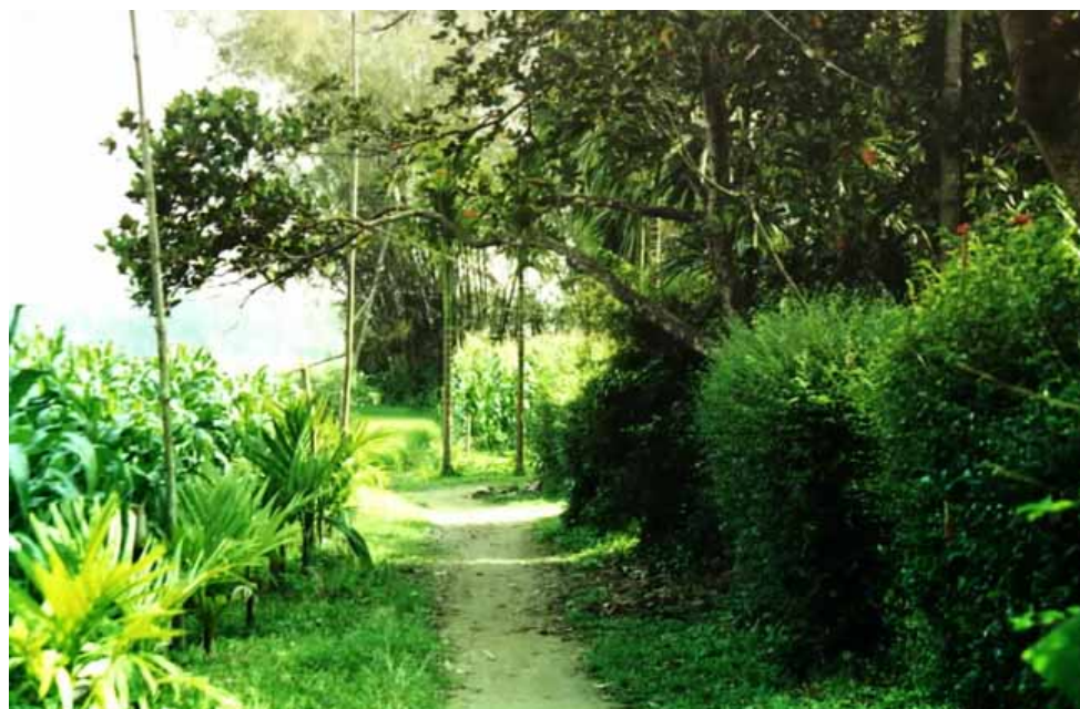
Hedgerows and trees separate villages and individual houses providing numerous hiding places.

Teams were dispatched to the scene and brought indirect fire into the area. Again the enemy disappeared into their spider holes and tunnels saturating the fields, hedgerows and surrounding tree lines.