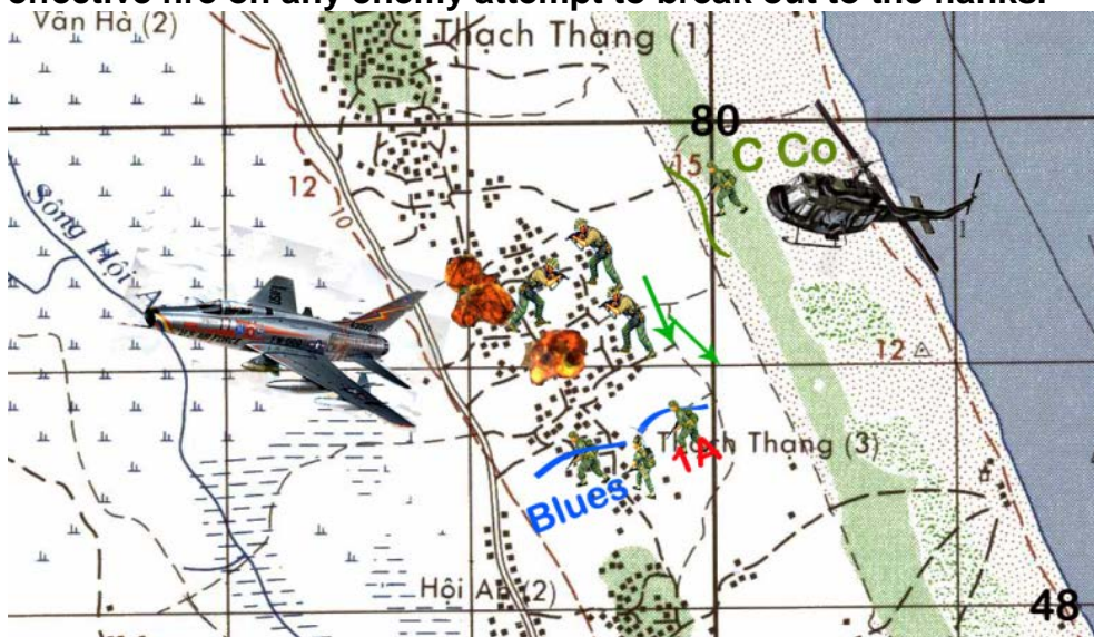
1A moved to the right of the Blue Team. C Company CAed in at 1005h and moved east

Observation and gunship teams from the 1/9 Cav provided early warning and flank security. In addition, the Red Team (Gunships) helped to keep the enemy retreat to a slow pace by placing effective fire on any enemy attempt to break out to the flanks.