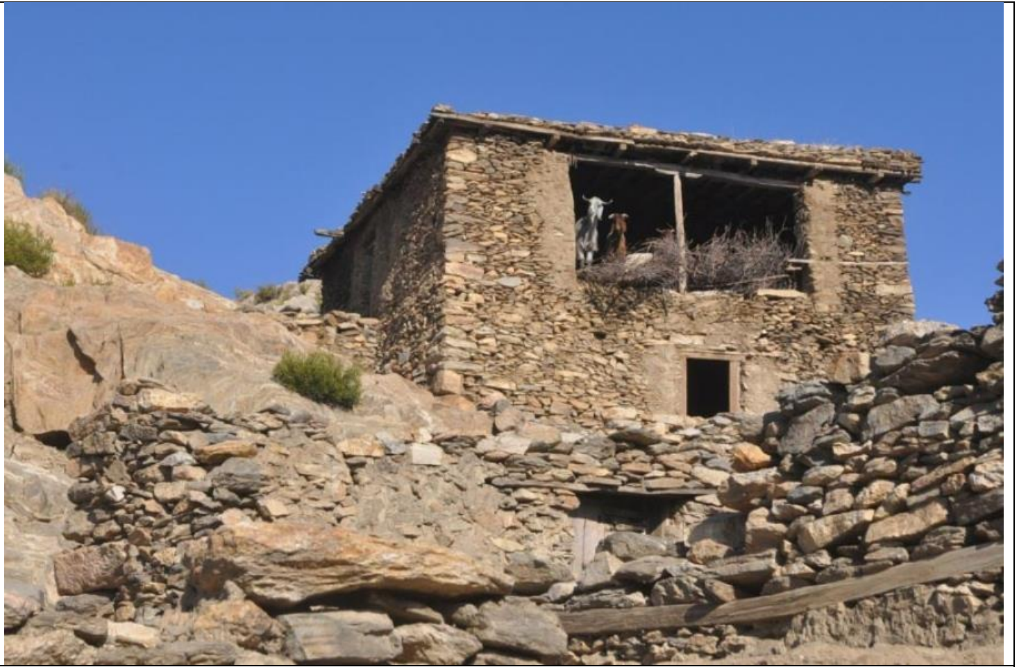
A pair of goats look on as U.S. and Afghan soldiers conducting a search mission move through the village of Barbar, a suspected Taliban enclave in eastern Afghanistan's Kunar province. MARTIN KUZ/STARS AND STRIPES

Credit to: https://www.stripes.com/archive/archived-special-reports/reporter-s-notebook/for-soldiers-on-afghan-patrol-too-much-time-is-on-their-side-1.169278